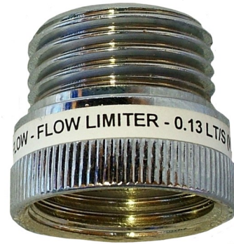
AFLE15FMWT – Automatic Flow Limiter for Shower Hoses with 0.13 Lt/s cartridge for limiting flow of water