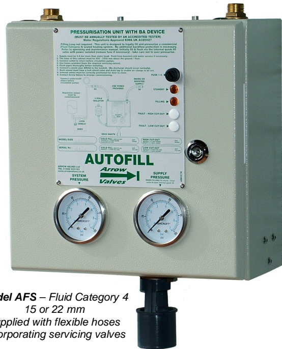
Model AFS – Fluid Category 4 15 or 22 mm supplied with flexible hoses incorporating servicing valves

Model AFP – features a pump for tall buildings without boosted cold water. The internal pump boosts the pressure by up to 2 bar (20 m). Assuming supply to Autofill is 1.5 bar (15 m), the maximum possible cold fill pressure is calculated as - Max cold fill pressure = 15 m – 6 m + 20 m = 29 m. The maximum system height above the Autofill is 27 m, which allows 2 m extra for venting.