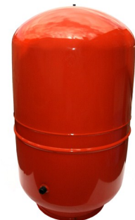
Expansion Vessel model - EVCP