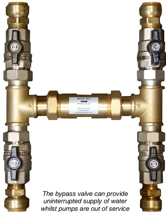
The bypass valve can provide uninterrupted supply of water whilst pumps are out of service

Pressure Supply 10 bar max. Temperature 65° max. Approval KIWA UK A030559