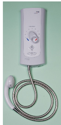
Care Shower consists of an electric shower and Booster Pump package