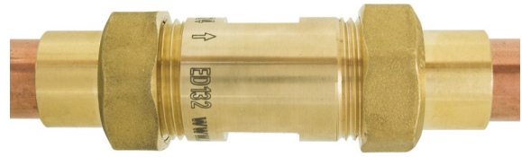
Model ED22SU132 22 mm Double Check Valve with Solder Unions