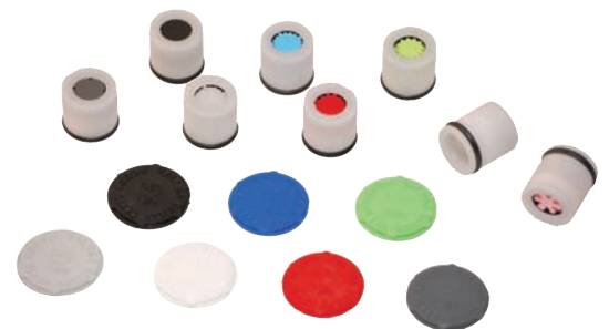
8 flow limiting cartridges each with a different flow rate ranging from 0.07 – 0.43 Lt/s. Strainer version also available.

By limiting the maximum flow rate guess work is removed from designing other aspects of the system such as pipe size, tanks and pumps.