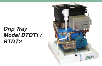
Drip Tray Model BTDT1 / BTDT2