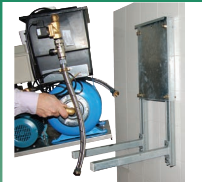
Wall mounting brackets Model BTBRA

Options - for fixed and variable speed units