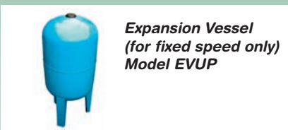
Expansion Vessel (for fixed speed only) Model EVUP

FOR FURTHER INFORMATION ON "BOOST-A-BREAK" AND MANY OTHER PRODUCTS PLEASE VISIT OUR WEBSITE AT: www.arrowvalves.co.uk