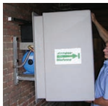
Wall Cover (brackets required) Model BTCAB3