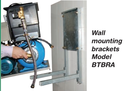
Wall mounting brackets Model BTBRA

Primarily designed to provide Fluid Category 5 backflow protection and to boost water pressure for high flow applications Options