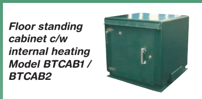
Floor standing cabinet c/w internal heating Model BTCAB1 / BTCAB2