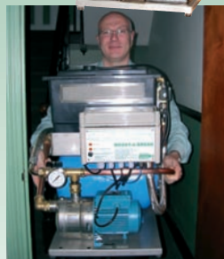
Light and compact