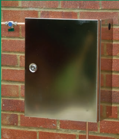
Packaged in a stainless steel cabinet