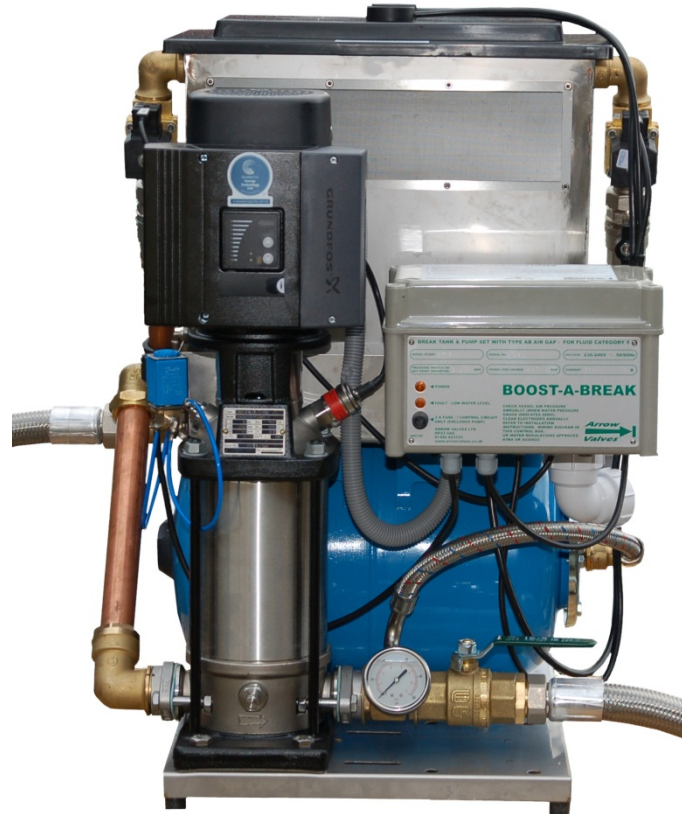
Model shown BTAB5-8