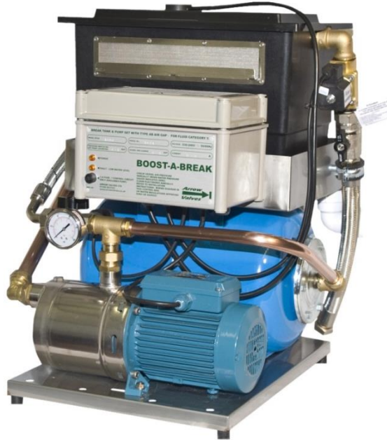
Model shown BTAB900 – Registered UK Design 4036013