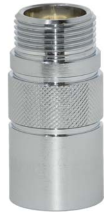
ED15FM235 Double Check Valve designed specifically for bath shower hoses – with optional Automatic Flow Limiting cartridge. Female Inlet, EPDM washer supplied