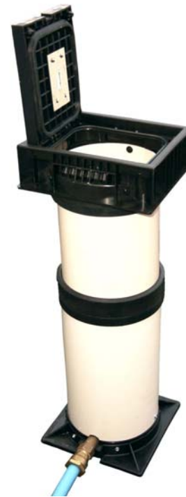
HUBG with 25 mm MDPE Inlet pipe shown

Two connections are provided at the base. The inlet is DZR brass for MDPE pipe. It is possible to 'daisy chain' the units by removing the blanking plug and connecting a second MPDE fitting.