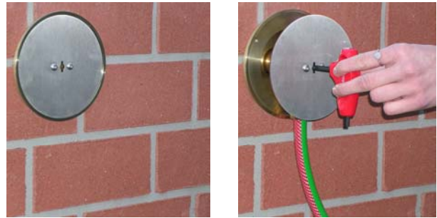
Conceal-A-Tap – brushed stainless disc. Suits any wall thickness

Housing Gunmetal Disc (standard) Stainless steel (brushed)