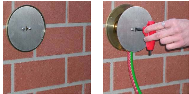
Conceal-A-Tap – brushed stainless disc. Suits any wall thickness

Housing Gunmetal Disc (standard) Stainless steel (brushed)