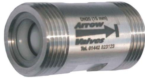
Model ED20MP316. Low head-loss 316 stainless DCV

Velocity based on flow of water through the bore of copper tube table X. "Conventional" is 15 mm compression valve with Watts CO015 cartridges. See Flow Table to find the actual flow rate.