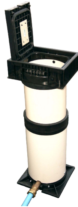
HUBG with 25 mm MDPE Inlet pipe shown

Long water box key – code BVBGKEY – allows access to below ground servicing valve.