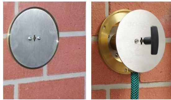
Conceal-A-Tap – brushed stainless disc. Suits any wall thickness