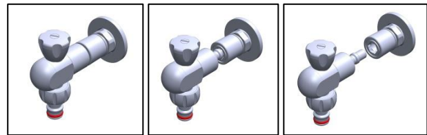
Push-fit connection allows tap to be easily removed when not in use