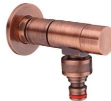
Detach-A-Tap Deluxe – available in Antique Bronze, Brass, Chrome and Copper